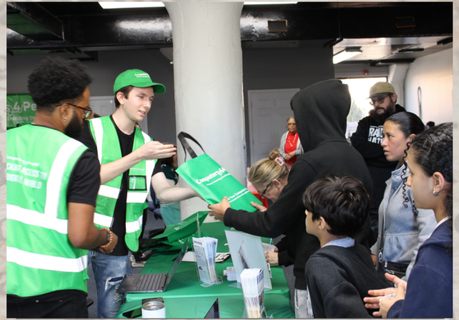
Closing the Digital Divide