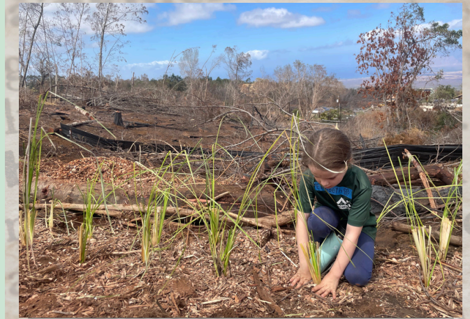
Restoring Hope in Maui